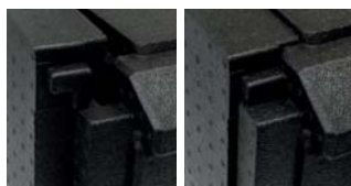
CHIUSURA A INCASTRO CLOSED JOINT